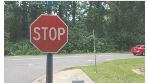
Controversial 'Luminous' project approved in Davidson