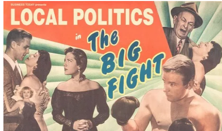
Social media confronts mainstream leaders